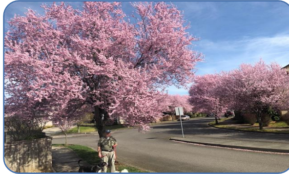
Springtime in the Village