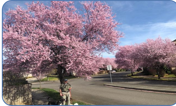
Springtime in the Village

The Village at Fisher's Landing Neighborhood Association (VFLNA) is a voluntary organization of residents who work together to improve and maintain the quality of life in its' neighborhood. Being a recognized entity by the City of Vancouver gives us a voice and advocate regarding issues within the city that impact our neighborhood. Membership is open to all property owners, and renters in the neighborhood. Click https://www.vflna.com/about.html to learn about all the ways the Board has supported the neighborhood.